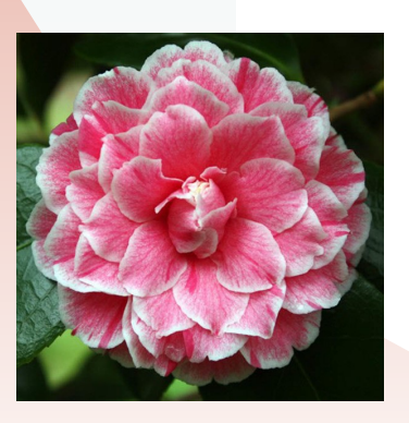
Camellia Japonica 'Herme'