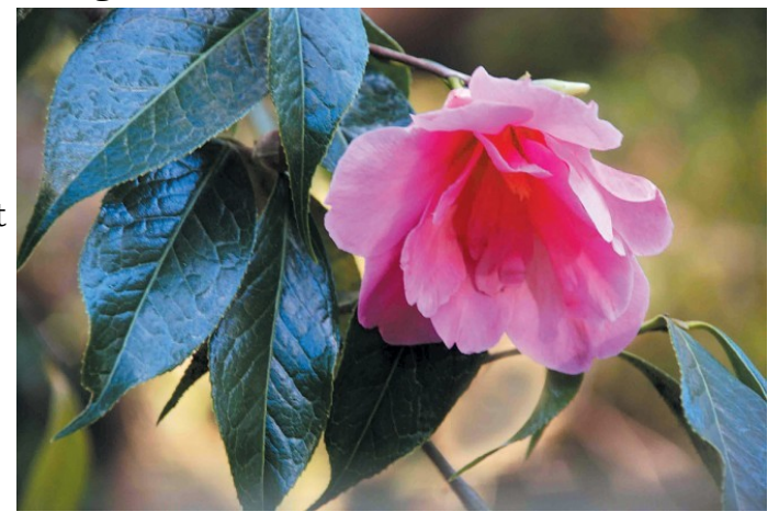
Camellia 'Shanghai Lady'