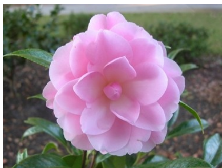
Buttons and Bows