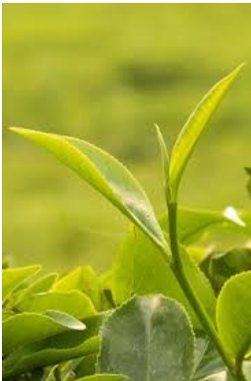
New Growth on camellia

After the blooms drop camellias start their growth season. You should be seeing new bright green stems and leaves. So what can you do to keep these precious plants healthy?